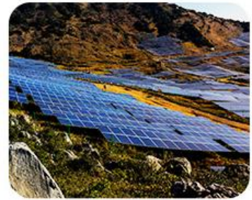
Mountain communication base station