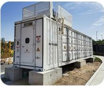
Communication base station energy storage