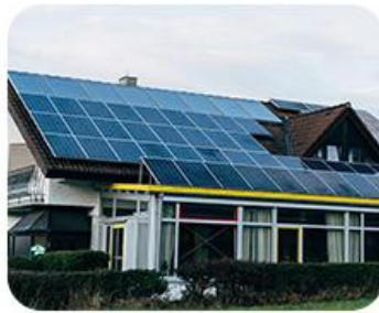
Home energy storage