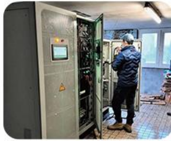
Industrial energy storage